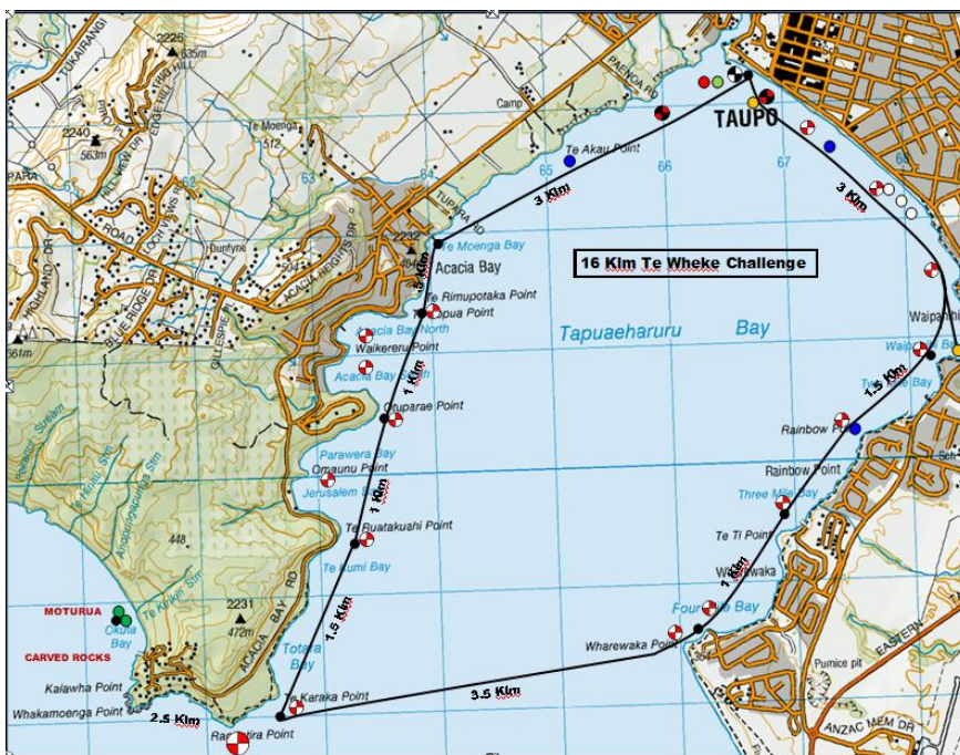
MAP 1: 16km Course